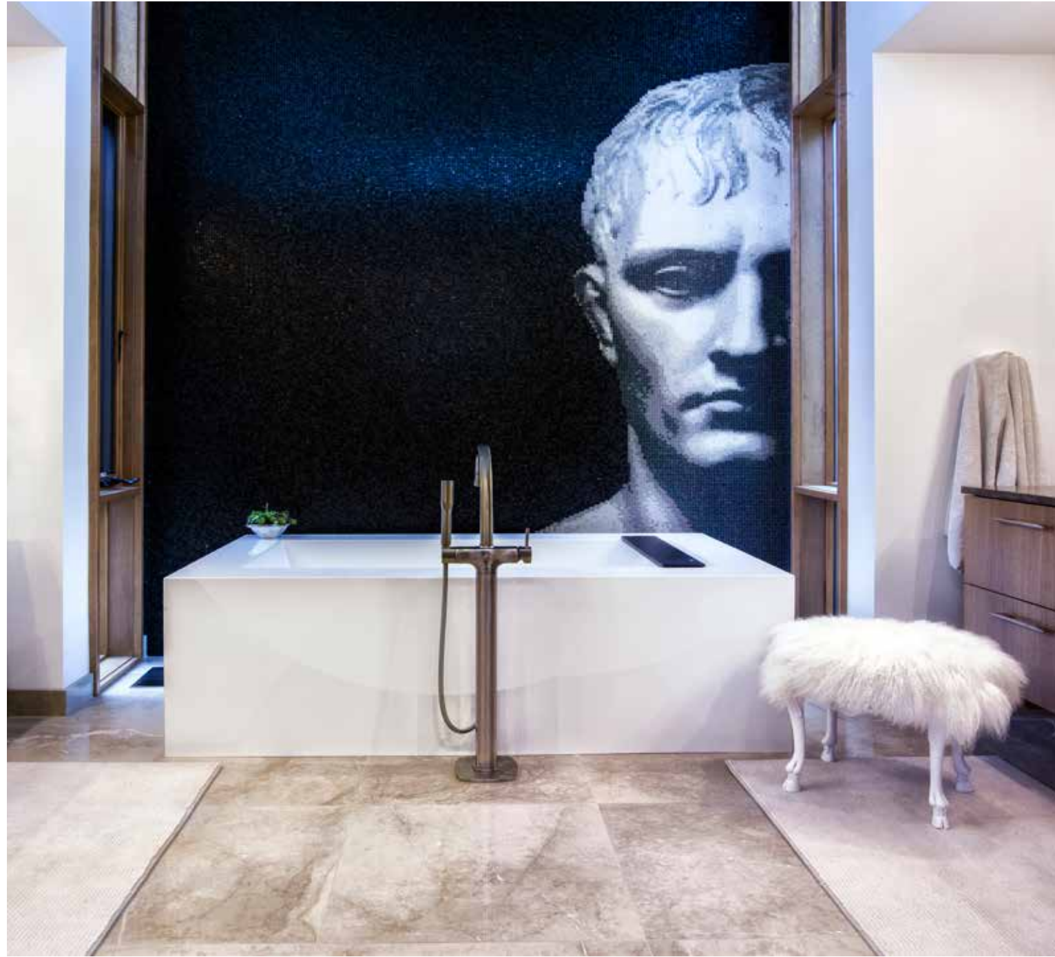
ABOVE Tile mosaic in master bath featuring image of the head of Napoleon.